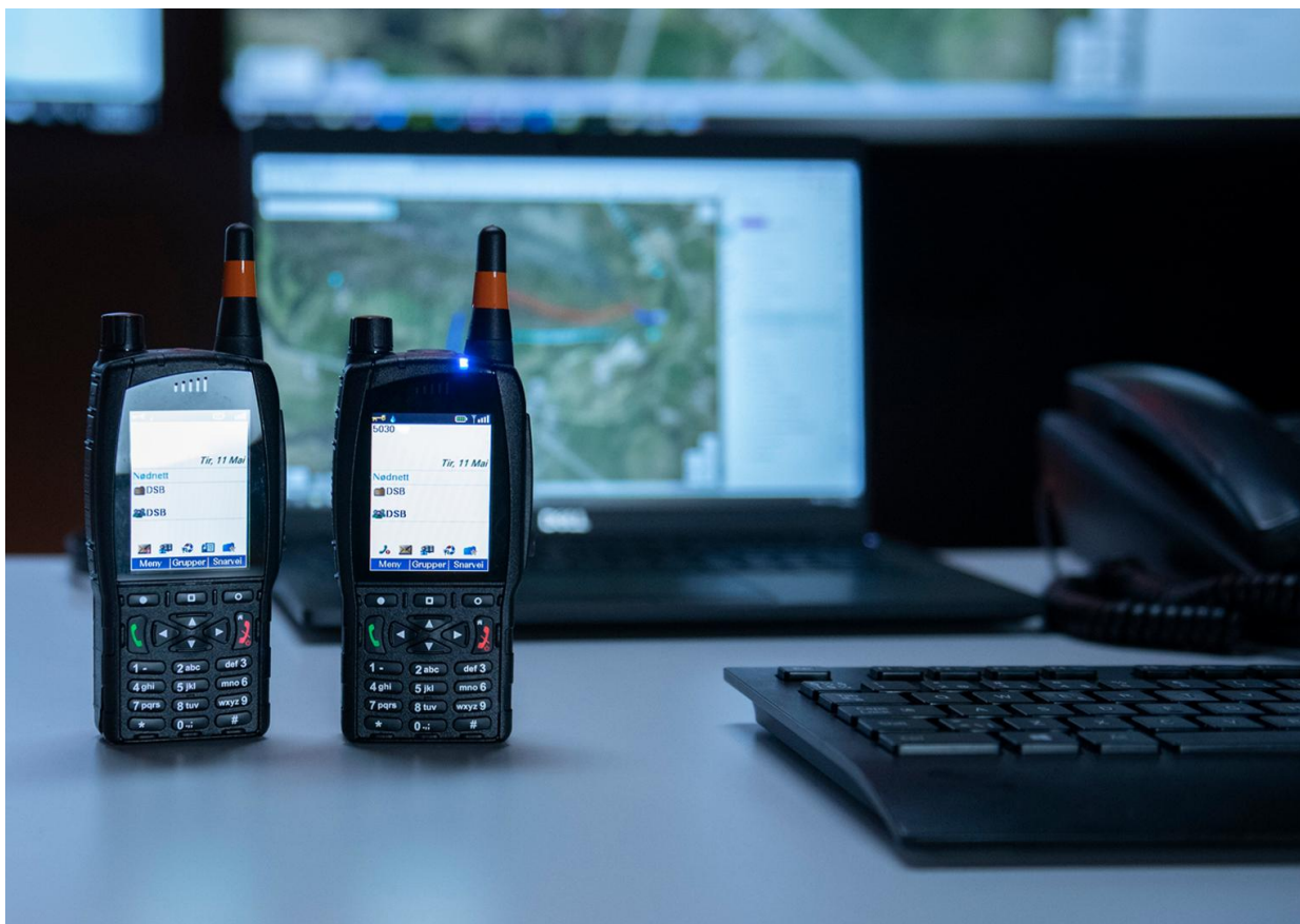
Figure 3: Cross-border communication in practice.

The second test was conducted 25.11.2025, with 24 participants from rescue services, emergency medical services, police, healthcare administration, regional emergency coordination, regional governance, social services administration and national providers. This was a functional test, meaning there were radio calls to check the functions of the chosen talk groups. The participants met in Teams, where information and coordination about the communication on Virve/Nødnett/Rakel were given by the group leaders.