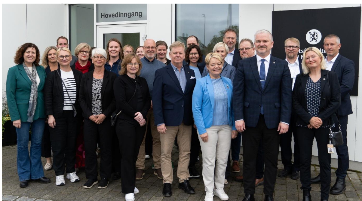
Picture 1: Participants at the Governors North meeting in Bodø, June 2025.

The Governors in the High North Cooperation has a yearly physical meeting. In 2025, the meeting was held 17.-18. June in Bodø. In addition, the preparedness directors, preparedness advisors and the crisis communication network met on the same dates.