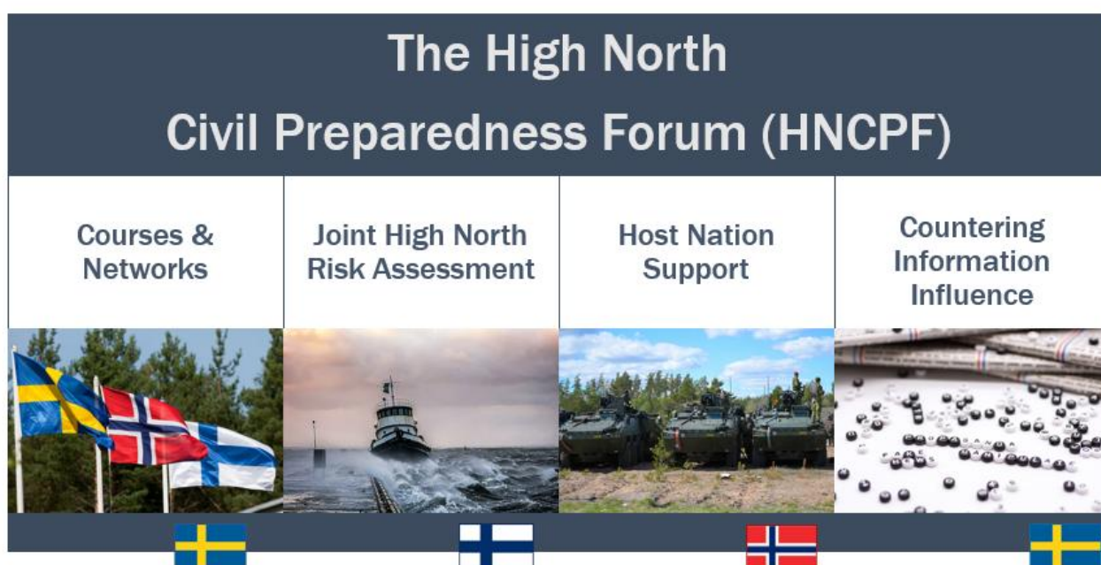
Figure 2: Overview of work packages in the HNCPF project

The application was presented to the HNC directors (the proposed Steering committee for the project) and approved in March of 2025. The project, titled The High North Civil Preparedness Forum , was approved by the Interreg Aurora Programme in June, and work began in September.